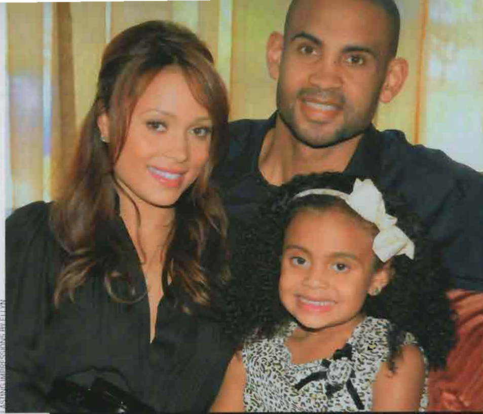
LASTING IMPRESSIONS BY ELLYN